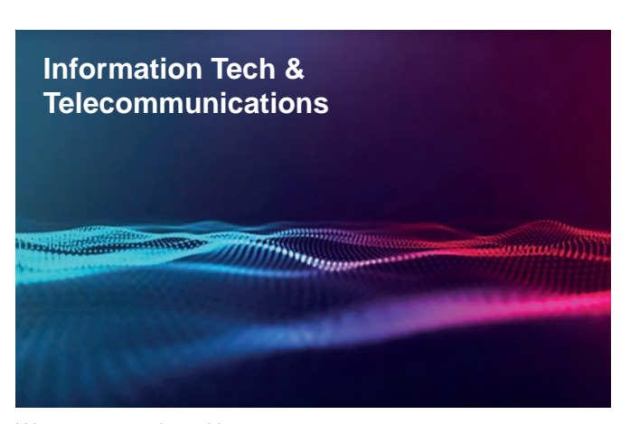
We connect today with tomorrow.