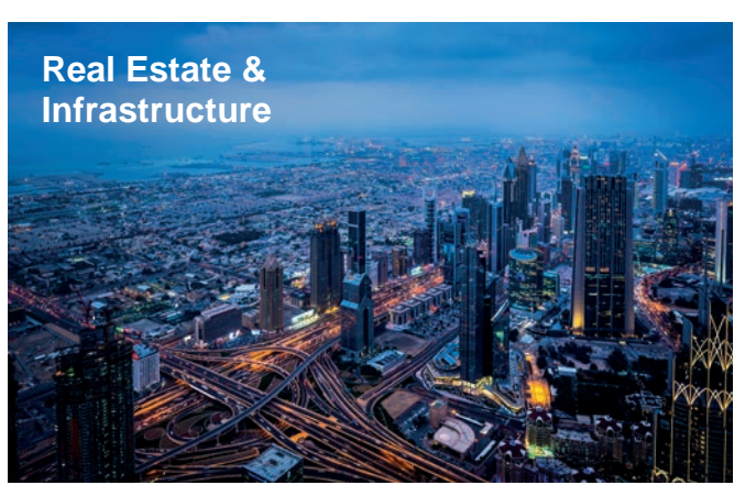
We lay the foundation for you to build on.