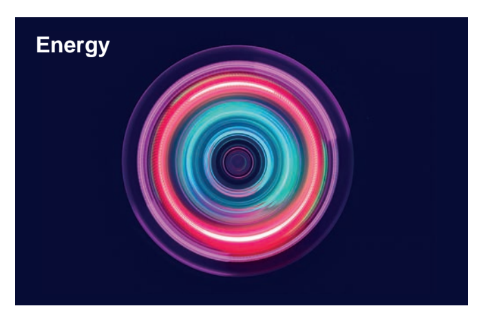
Conventional or renewable energies: We work efficiently and sustainably.

We focus on advising transactions with respect to targets in five industries.