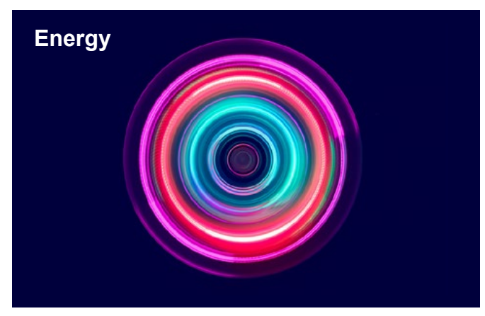
Conventional or renewable energies: We work efficiently and sustainably.

We focus on advising transactions with respect to targets in five industries.