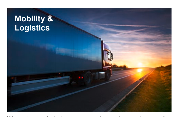
We understand what gets you moving and can set you on the right course.