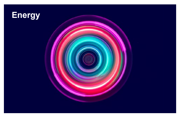
Conventional or renewable energies: We work efficiently and sustainably.

We focus on advising transactions with respect to targets in five industries.