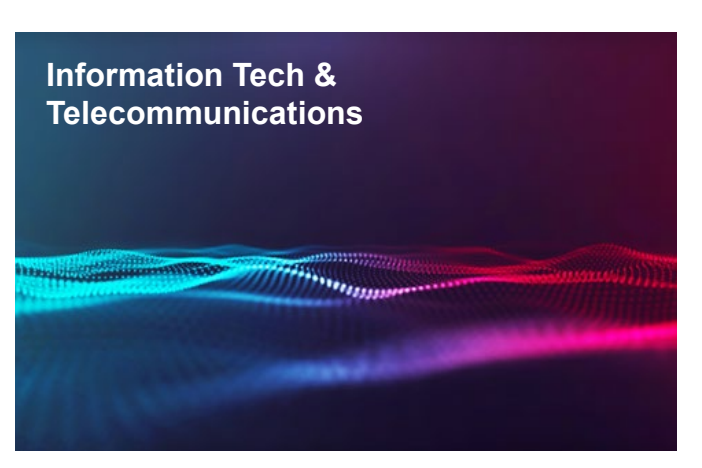
We connect today with tomorrow.